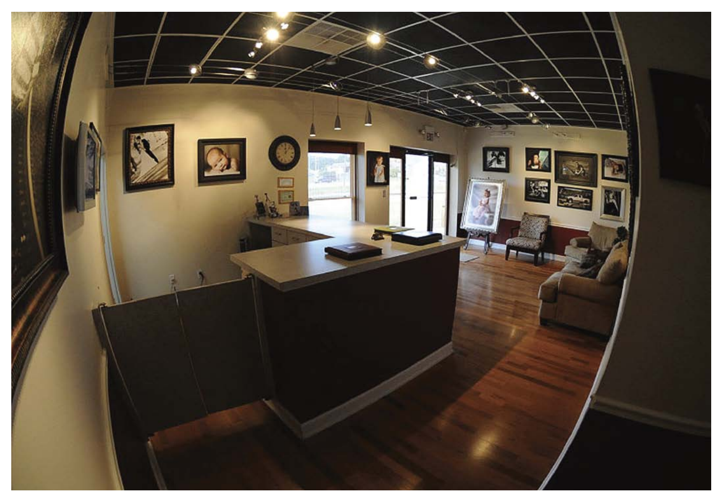
The design, lighting, and merchandising of your studio let clients know where you stand in the market.

New referrals are also directed to our web site, which, again, immediately familiarizes them with our work. We give these prospective clients a password and allow them to browse through a wide variety of images. This allows them to get to know us at their convenience without having to schedule an initial sit-down visit. After viewing the images, a face-to-face meeting is scheduled—but only once mutual interest has been generated. Again, our Internet presence saves us a lot of time. If we aren't what