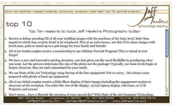
At Jeff Hawkins Photography, their web site makes it clear to clients that they are working with a unique, top-notch professional.

the client is looking for, they find out before they make the trek to our studio, and it saves us from investing time and energy in someone that may or may not be the right client right for us.